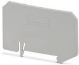
Partition plate, length: 73.5 mm, width: 2 mm, height: 47.2 mm, color: gray

Please be informed that the data shown in this PDF Document is generated from our Online Catalog. Please find the complete data in the user's documentation. Our General Terms of Use for Downloads are valid ( http://phoenixcontact.com/download )